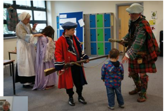
'All stalls told something about our surroundings'