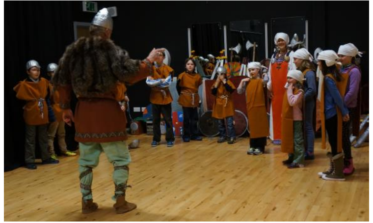
'There was lots for the kids—we've spent most of the day here'

Around 400 people attended the Highland Family Heritage Festival in April. With activities for children and adults, workshops demonstrating traditional crafts or inviting people to have a go, talks, stalls from local museums and heritage groups, there was certainly something for everyone. Evaluation forms praised almost every activity, showing the wide range of interests. Many people stayed the entire day. It was a great day which we hope to repeat in the future!